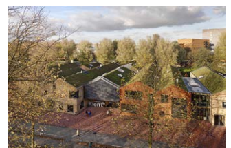
Kiem Special Care School, Dordrecht, NL Size: 5,300 m 2 Year: 2010 - 2013