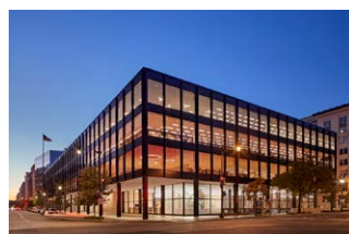
Martin Luther King Jr. Memorial Library, Washington D.C., US Size: 43,000 m 2 Year: 2014 - 2020