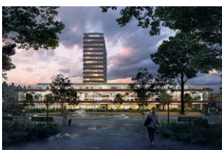
De Nederlandsche Bank, Amsterdam, NL Size: 65,000 m 2 Year: 2018 - 2023