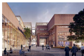
Generalsanierung Gasteig, München, Germany Size: 90,000 m 2 Year: 2018