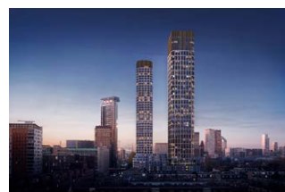
The Grace, The Hague, NL Size: 120,000 m 2 Year: 2018